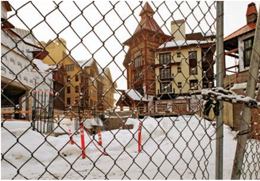
Construction stopped at this Tamarack 'village' when the resort was handed to a receiver.